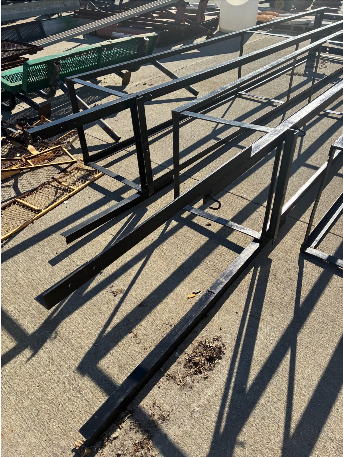
Sign sits directly in a channel on top of the towers